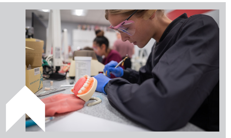
The 60-year-old+ dental hygiene program, and related dentistry majors, educate students while serving the community through affordable oral healthcare in the on-campus David A Bleeke Dental Hygiene Clinic. These programs are one example of how IU Fort Wayne provides a skilled workforce to medical offices statewide.

IU Fort Wayne gives northeast Indiana residents (and beyond) the opportunity to