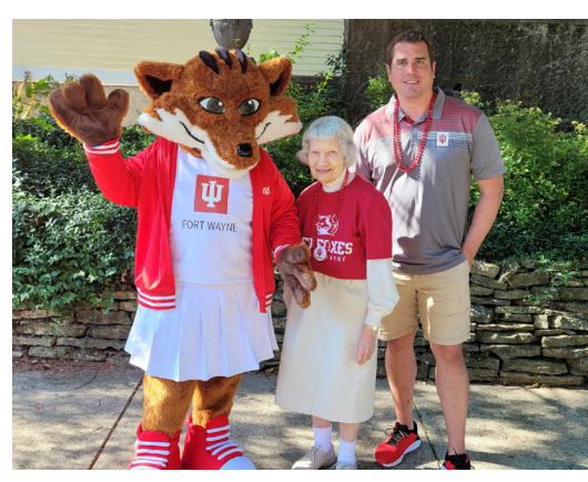
Ruby the Red Fox and alumni gather for the Three Rivers Festival parade.

Alumni responded to the lack of IU branding and engagement with feedback that we need to improve connections and increase visibility. The alumni population includes 33,297 IU-degree-holding graduates (1964-2018).